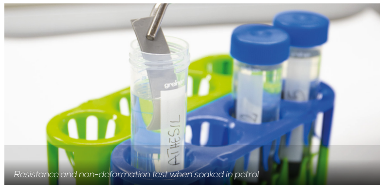
Resistance and non-deformation test when soaked in petrol

Other silicones tend to absorb gasoline, oil and other liquids causing deformation. Athesil resists mineral and synthetic oils, lubricants, fuels, greases, coolants, and detergents, ensuring ideal shape retention and adhesion to surfaces .