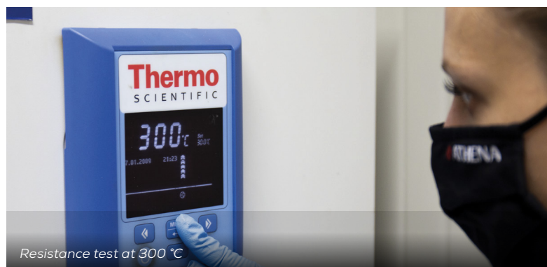
Resistance test at 300 °C

Athesil is thermally stable from -40 °C to 220 °C (-40°F to 430° F) performing even at 300 °C (572° F) peaks. It resists aging, weathering, and thermal cycling without hardening, shrinking, or cracking . Athesil can also be applied to the exhaust system and will not damage lambda sensors.